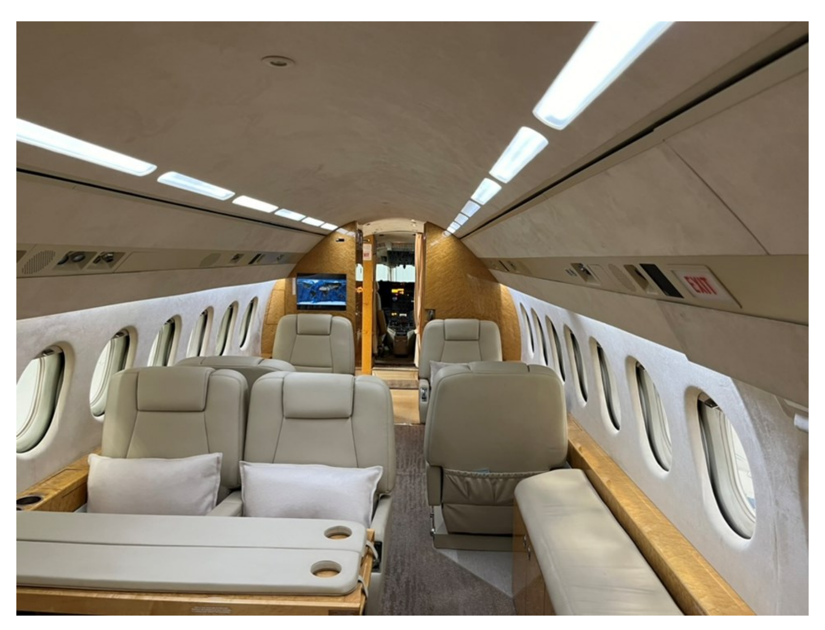
12 Passenger Executive Interior